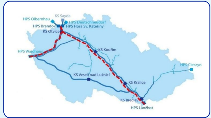
Czech Hydrogen Backbone Infrastructure

Preparatory activities are progressing at full speed; material testing has been completed and building permit applications for the first project will be submitted already in 2026. Commissioning of the Czech Hydrogen Backbone Infrastructure – West project is planned for 2031 , followed by the North route in 2032 .